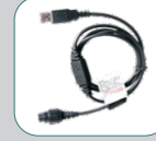
Programming cable (optional)