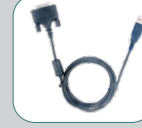
Programming connecting line (optional)