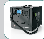
SPM6000 F fix station (optional)