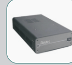
Power supply (optional)