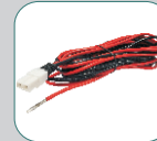
Power supply cable