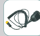
Non-numeric hand microphone