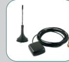
Beidou/GPS antenna (optional)